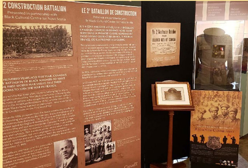
Photo from the Black Cultural Centre in Cherry Brook, NS.